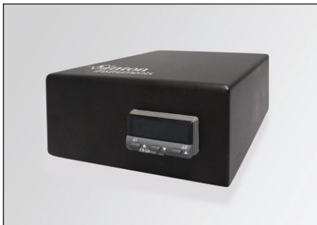
WCT-120TS temperature control box.