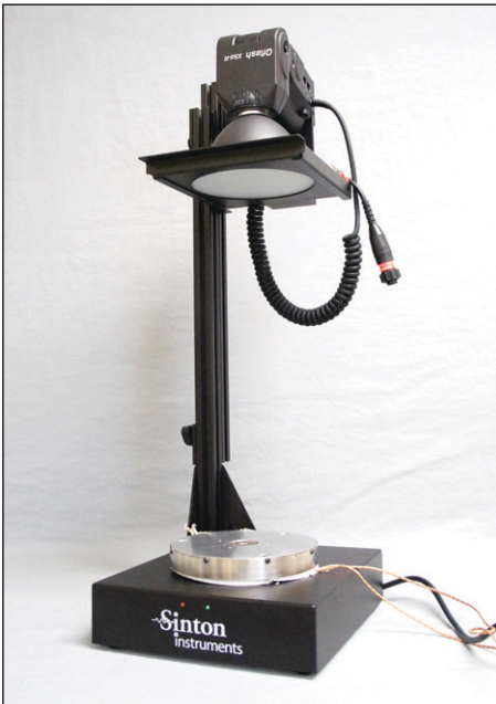
The WCT-120TS is an affordable, tabletop silicon lifetime and wafer metrology system.

Wafer measurement instrument offering calibrated analysis of temperature-dependent carrier-recombination lifetime.